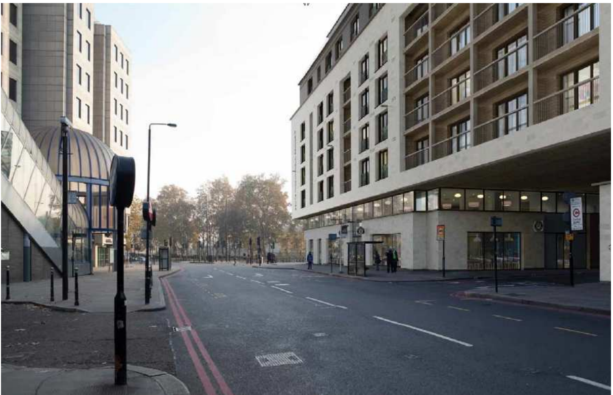
Figure 4: Verified view of proposal looking south along Minories