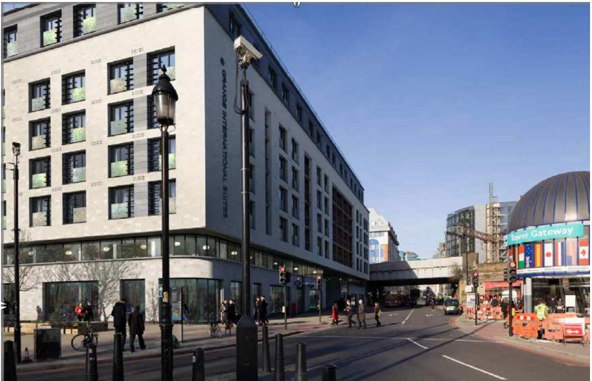
Figure 3: Verified view of proposal looking north along Minories