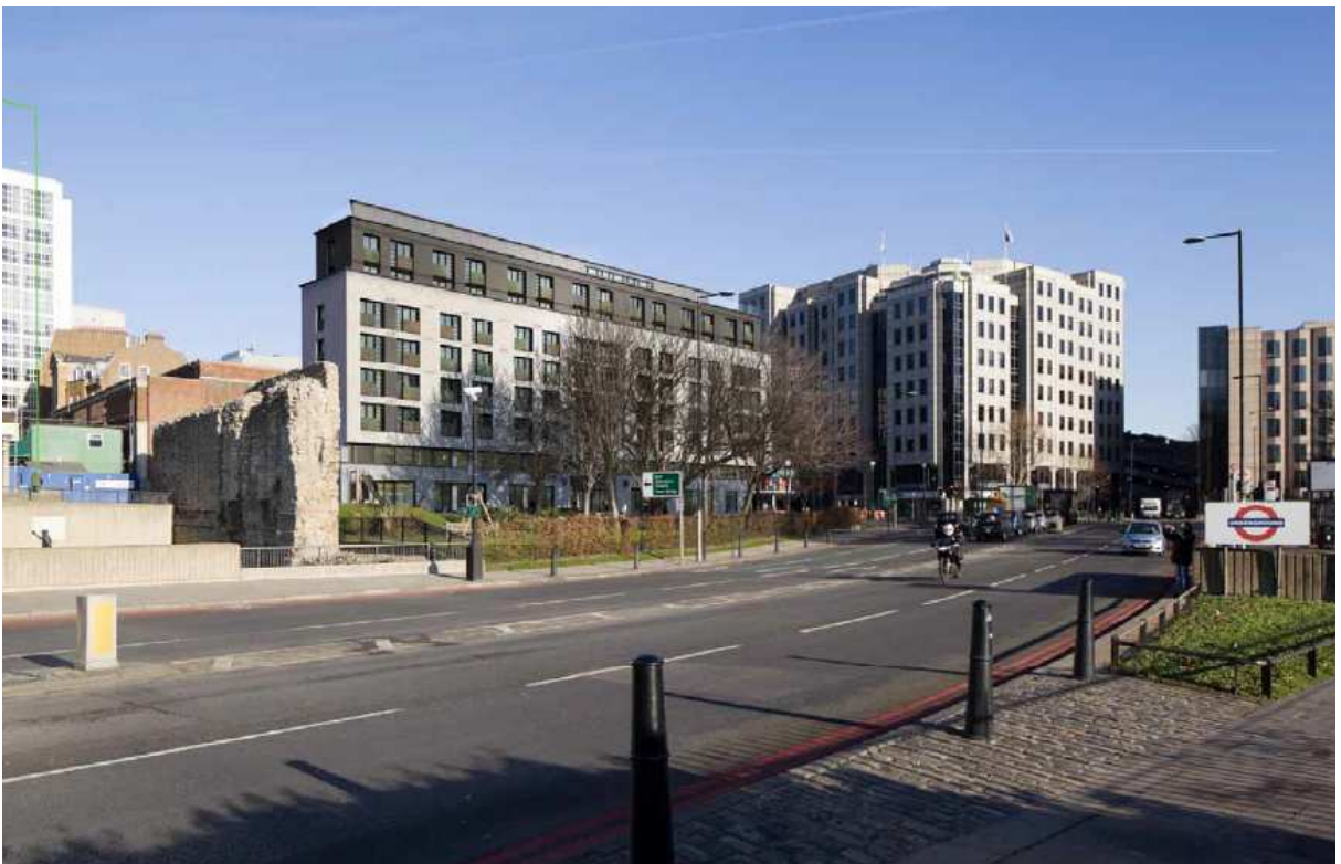
Figure 2: Verified view of proposed building from Tower Hill (south west)