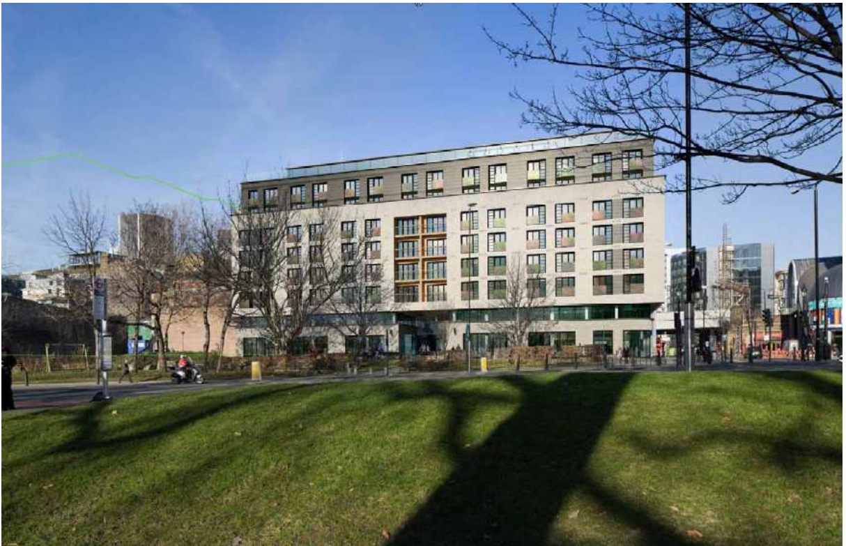
Figure 1: Verified view of proposed building from south