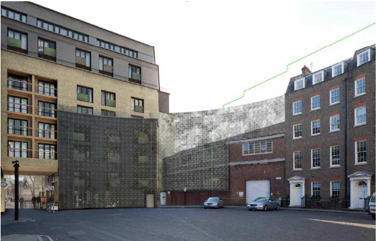
Figure 5: Verified view of rear elevation of proposed building and screen from within The Crescent